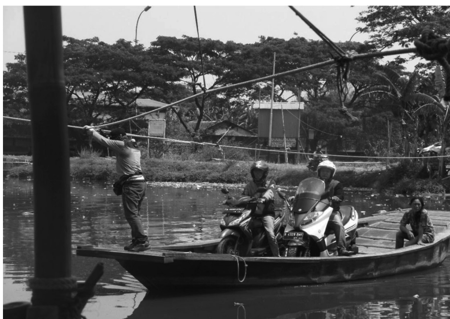
Image 1. Distance from Pancuran Village to Tegalrejo Health Center (Puskesmas) or Dr. Asmir Hospital

other types of puskesmas for other targets. Furthermore, the development of the principles of human rights in terms of availability, access, adaptation, equality and universality must be considered especially for elderly women. Difficulties to access the elderly posyandu with a common program makes elderly women reluctant to visit it. Apparently not all elderly posyandu services are accessed by the elderly.