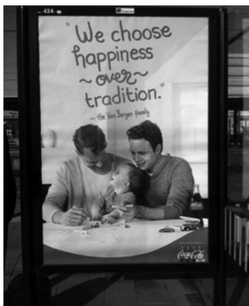
Image 1. Advertising of Coca Cola Co. When 'happiness' is defined through representation of a homosexual family

Regardless of the sharp criticism of this negativity, I will try to continue Ruti's criticism. First, the politics of negativity tend to depoliticize queer politics – then in which direction is the queer struggle headed when the queer subject is expected to put him- or herself in this abject position? Isn't it possible to change the unfair social structure? Secondly, when the negativity of queers is made the norm, what then is the difference with dominant hegemony norms? Is there no other political option that is not hegemonic, but emphasizes the diversity of political positions or changes to existing social structures? Thirdly, many marginalized groups have